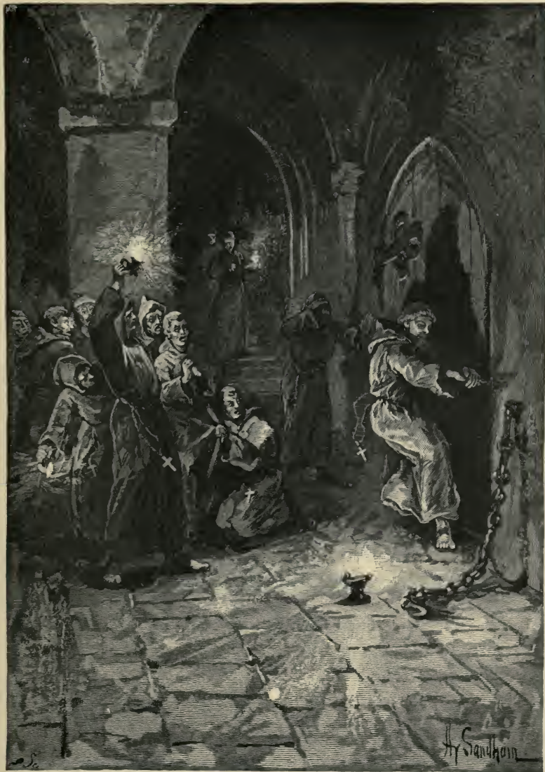
"LEGEND OF ARA-CÆLI." Page 108.